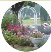
Pilgrim Rose Garden